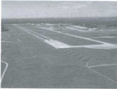
Fig. 10.1. Westover Air Reserve Base, Chicopee, Massachusetts, USA. Airfields often contain large expanses of vegetation, typically composed of turfgrasses and herbaceous vegetation.

ing cover for hazardous wildlife (DeVault et al. 2011), and resist invasion by other plants that provide food and cover for wildlife (Austin-Smith and Lewis 1969, Washburn and Seamans 2004, Linnell et al. 2009; Fig. 10.1).