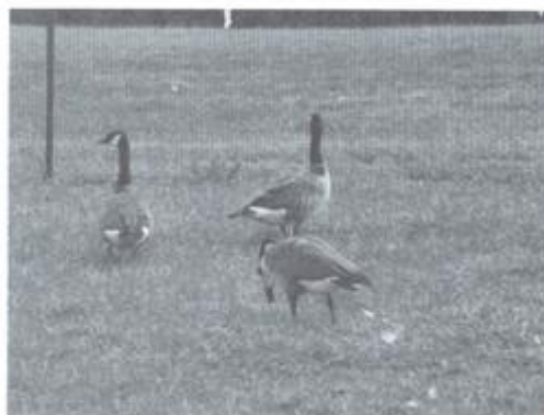
Fig. 10.3. Canada geese in study plot. Research examining the foraging preferences of Canada geese provides information about the selection of plant materials for reseeding projects at airports.

Grazing Anatidae (including various species of geese) apparently make foraging choices based on the nutritional content and chemical composition of plants (Gauthier and Bedard 1991, McKay et al. 2001, Durant et al. 2004). The concentration of protein within forage plants is an important component in the foraging preferences for a variety of goose species, including barnacle geese ( B. leucopsis ; Prins and Ydenberg 1985), dark-bellied brent geese ( B. bernicla bernicla ; McKay et al. 2001), white-fronted geese ( Anser albifrons albifrons ; Owen 1976), graylag geese ( A. anser ; Van Liere et al. 2009), and Canada geese (Sedinger and Raveling 1984, Washburn and Seamans 2012). In addition, sec-