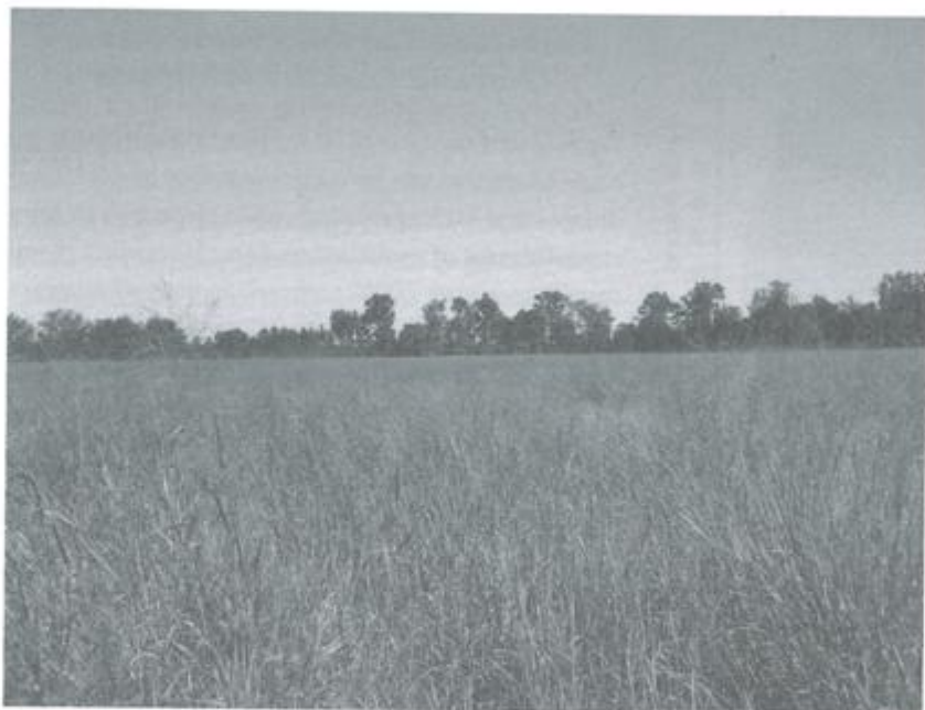
Fig. 11.3. Switchgrass ( Panicum virgatum ) field planted for biomass production near West Point, Mississippi, USA.

Fig. 11.3). But many of these studies were conducted on Conservation Reserve Program fields, which limit applicability to biofuel production at airports. Recent studies examining impacts of cellulosic biofuel crops on wildlife indicate that both Miscanthus and native grasses, including switchgrass and native warm-season grasses (as mentioned earlier), may provide benefits to some birds during winter and breeding seasons (Murray et al. 2003, Bellamy et al. 2009, Sage et al. 2010). The benefits of Miscanthus are temporary, however, without continuous wildlife management practices necessary to maintain the features of established plots that are attractive to birds (Bellamy et al. 2009). These features may be lost if plots are managed primarily to maximize biofuel production (Bellamy et al. 2009). There are additional questions regarding wildlife response to large plots of Miscanthus in the USA, as the vegetation structure is different from native grasslands, and it is unknown if avian species would perceive the bamboo-like vegetation as suitable habitat (Fargione et al. 2009).