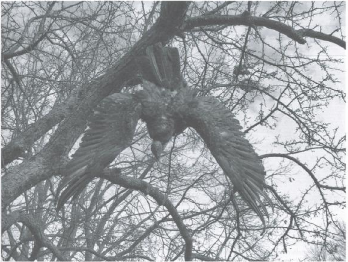
Fig. 2.2. Taxidermy mount of a turkey vulture suspended as an effigy to deter roosting by conspecifics.

brown-headed cowbirds ( Molothrus ater ) and mourning doves ( Zenaida macroura ), as well as properties of the visual system for both species. The authors found that vehicle lighting (i.e., the visual cue) can influence the avoidance behavior by cowbirds and that reaction to vehicle approach and light treatments was also affected by ambient light. Avoidance behavior by doves was not affected by lighting treatments, but doves became alert more quickly (on average by 3.3 s) than cowbirds. In contrast, cowbirds took flight sooner than doves. The authors also found that doves have a wider field of vision and can detect objects at a greater distance due to their higher visual acuity; however, cowbirds might flush earlier to reduce predation-risk costs associated with lower ability to visually track a given object. In extending their findings to reducing bird collisions with aircraft, Blackwell et al. (2009) suggested that there is potential to design vehicle-mounted