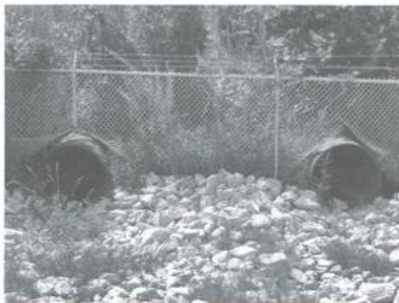
Fig. 5.1. Breaches in airport fencing can allow easy access to the air operations area. From DeVault et al. (2008)

and could be suitable in limited, though unspecified, situations at airports (Castellano 2002). In 2004, an additional CertAlert was released that included all of the above information but specified that gates in fence lines must provide no more than a 15.2-cm (6-inch) gap that could potentially allow access by deer (Castellano 2004). Minimum recommendations provided in the CertAlerts for chain-link fences are appropriate when land managers must virtually eliminate access by medium to large mammals, realizing there is always potential for a break in a fence to occur by uncontrollable causes.