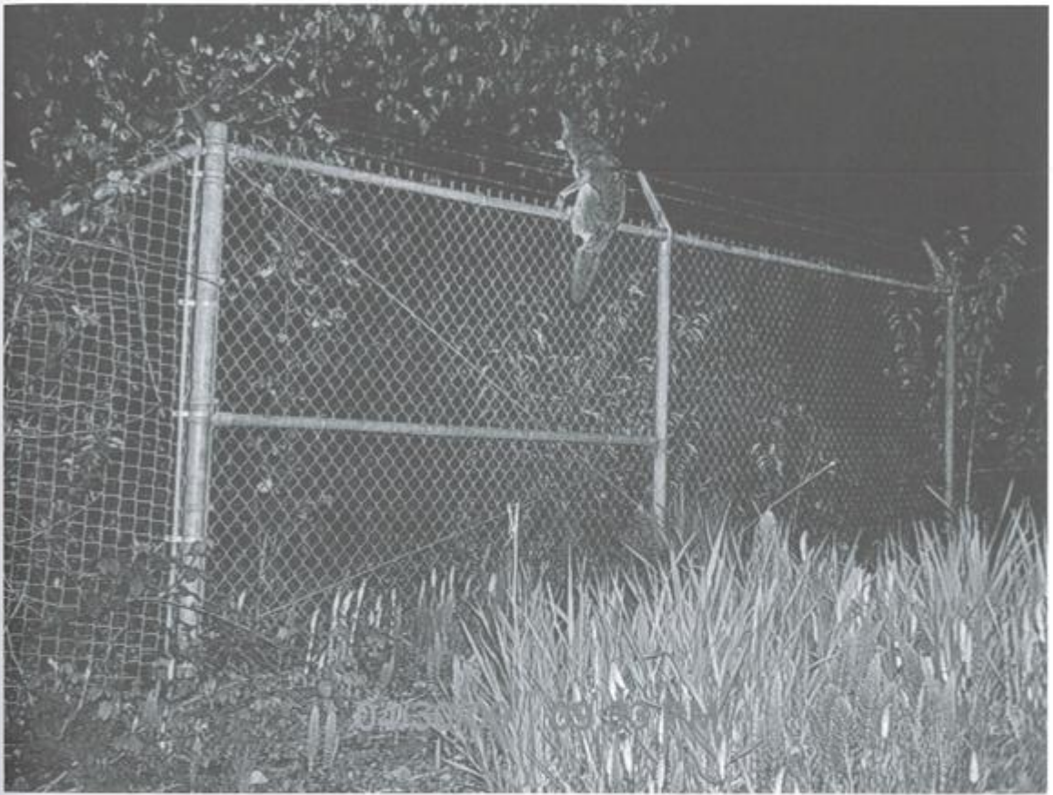
Fig. 5.2. Coyote scaling a fence at a major western U.S. airport.

Openings in fences that appear small enough to impede deer may actually be large enough for motivated deer or other mammals to squeeze through. Adult white-tailed deer were able to pass through a 25.0-cm (10-inch) gap at the bottom of a fence (Falk et al. 1978, Palmer et al. 1985, Feldhamer et al. 1986). Caribou ( Rangifer tarandus ) will also pass through a fence rather than jump, even though they are capable of jumping 2.2 m (7.5 feet; Miller et al. 1972). Coyotes are capable of crawling through 15.2 × 10.2 cm (6 × 4 inch) openings and can walk through 30.5-cm (12-inch) mesh (Thompson 1978). Ward (1982) reported that a 15.0-cm (6-inch) gap under a fence was enough to allow passage by mule deer, and Feldhamer et al. (1986) documented deer in Pennsylvania, USA, passing through 19.0-cm (7.5-inch) openings. Ultimately, a fence must be of sufficient height, tight to the ground or preferably buried, and lack gaps >15.0 cm 2 (2.3 inches 2 ) to ensure exclusion of deer.