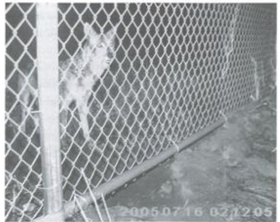
Fig. 5.3. Some mammals, including coyotes, can penetrate fencing without a belowground apron by burrowing. From DeVault et al. (2008)

Openings in fences that appear small enough to impede deer may actually be large enough for motivated deer or other mammals to squeeze through. Adult white-tailed deer were able to pass through a 25.0-cm (10-inch) gap at the bottom of a fence (Falk et al. 1978, Palmer et al. 1985, Feldhamer et al. 1986). Caribou ( Rangifer tarandus ) will also pass through a fence rather than jump, even though they are capable of jumping 2.2 m (7.5 feet; Miller et al. 1972). Coyotes are capable of crawling through 15.2 × 10.2 cm (6 × 4 inch) openings and can walk through 30.5-cm (12-inch) mesh (Thompson 1978). Ward (1982) reported that a 15.0-cm (6-inch) gap under a fence was enough to allow passage by mule deer, and Feldhamer et al. (1986) documented deer in Pennsylvania, USA, passing through 19.0-cm (7.5-inch) openings. Ultimately, a fence must be of sufficient height, tight to the ground or preferably buried, and lack gaps >15.0 cm 2 (2.3 inches 2 ) to ensure exclusion of deer.