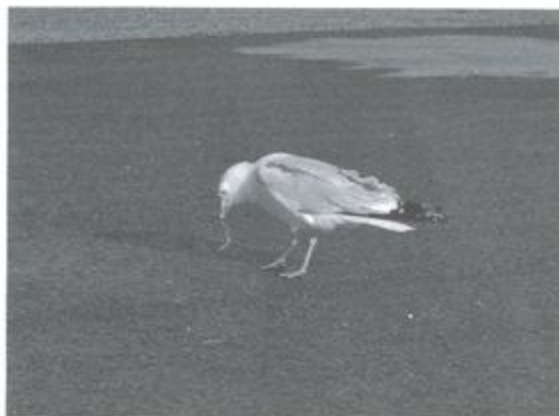
Fig. 8.2. A ring-billed gull ( Larus delawarensis ) feeds on earthworms on an active airport taxiway. Direct observation of wildlife foraging in airport environments can identify important food resources.

before initiating management of food resources. Furthermore, a more robust analysis of food selection may be warranted when contemplating management (e.g., removal) of a valuable or sensitive resource, such as expensive landscaping plants established at the airport for aesthetic reasons.