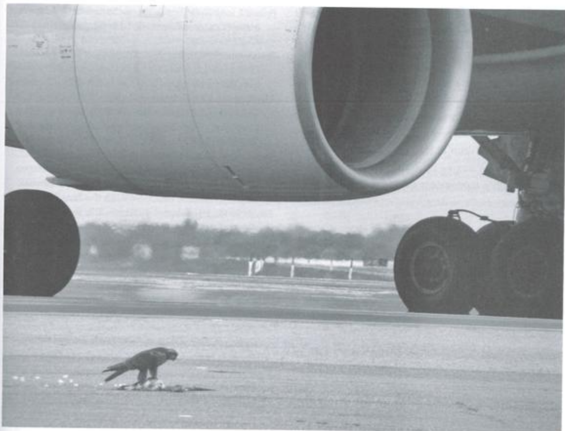
Fig. 8.3. A peregrine falcon ( Falco peregrinus ) feeds on a gull carcass at a major airport in the eastern USA. Animal carcasses found on airfields should be removed immediately upon discovery so they do not attract hazardous wildlife.