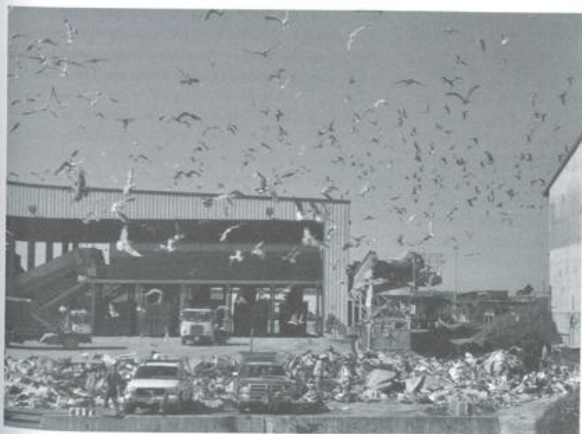
Fig. 8.4. When not managed properly, solid waste management facilities like this trash-transfer station can attract wildlife hazardous to aviation.