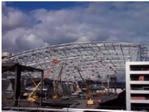
Within 2 weeks of completion, starlings and pigeons had started roosting in this canopy constructed over the passenger drop-off area at a major USA airport.

Passive habitat modification can take place throughout the airport environment. Airport buildings can be designed and constructed, or modified, to take away nesting and perching sites.