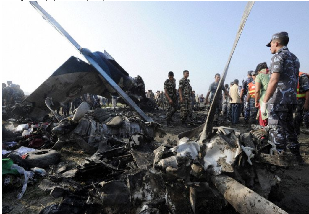
Scenes after the crash:

Both engines and propellers side by side: