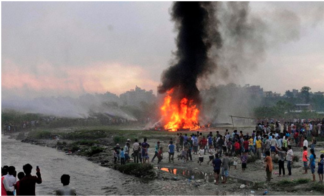
The remains of 9N-AHA: