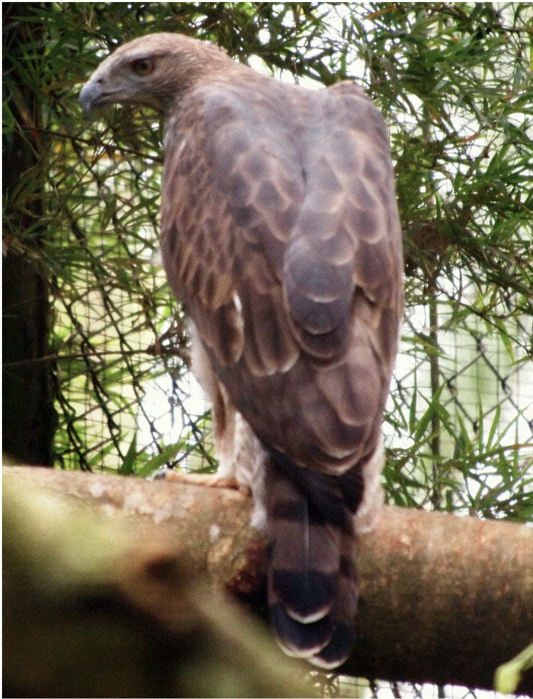
Map (Graphics: AVH/Google Earth):